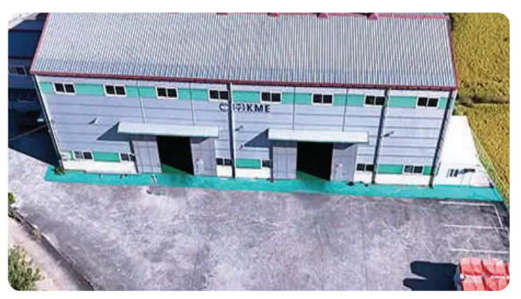
Gimhae (Office/factory) 25, Seobu-ro 1331beon-gil, Juchon-myeon, Gimhae-si, Gyeongsangnam-do, Republic of Korea