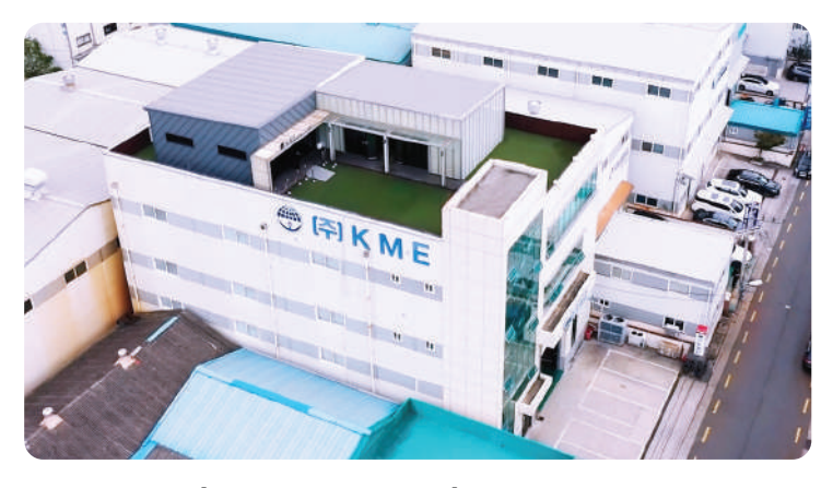
Busan (Head Office) 29, Nakdong-daero1302 beon-gil, Sasang-gu, Busan, Korea