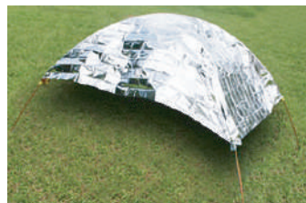
Sun block mesh

Lightweight and durable, reduces the risk of hypothermia during emergency evacuation.