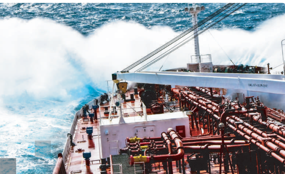
◀ In the event of damage caused by a storm

KME offers a range of emergency support products to ensure safety and survival in the marine industry. The products provided to protect lives and increase survival chances in emergency situations during navigation are suitable for all ship environments, offering ease of use and reliable quality.