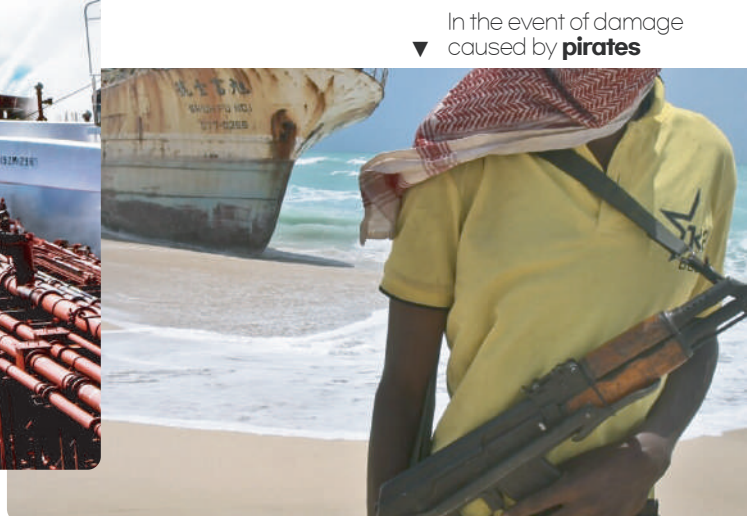
▼ In the event of damage caused by pirates