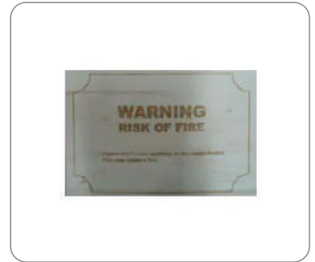
Sauna Warning Sign