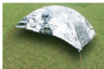
Sun block mesh

Lightweight and durable, reduces the risk of hypothermia during emergency evacuation.